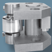
ADVANTAGE Series Load Point with C2 Calibration

Hardy carries a wide variety of strain gauge load points and scale bases to accommodate your application requirements.