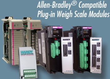
Allen-Bradley® Compatible Plug-in Weigh Scale Modules

Controllers, Weigh Modules, Transmitters