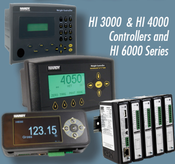
HI 3000 & HI 4000 Controllers and HI 6000 Series