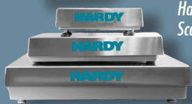
Hardy Bench Scales